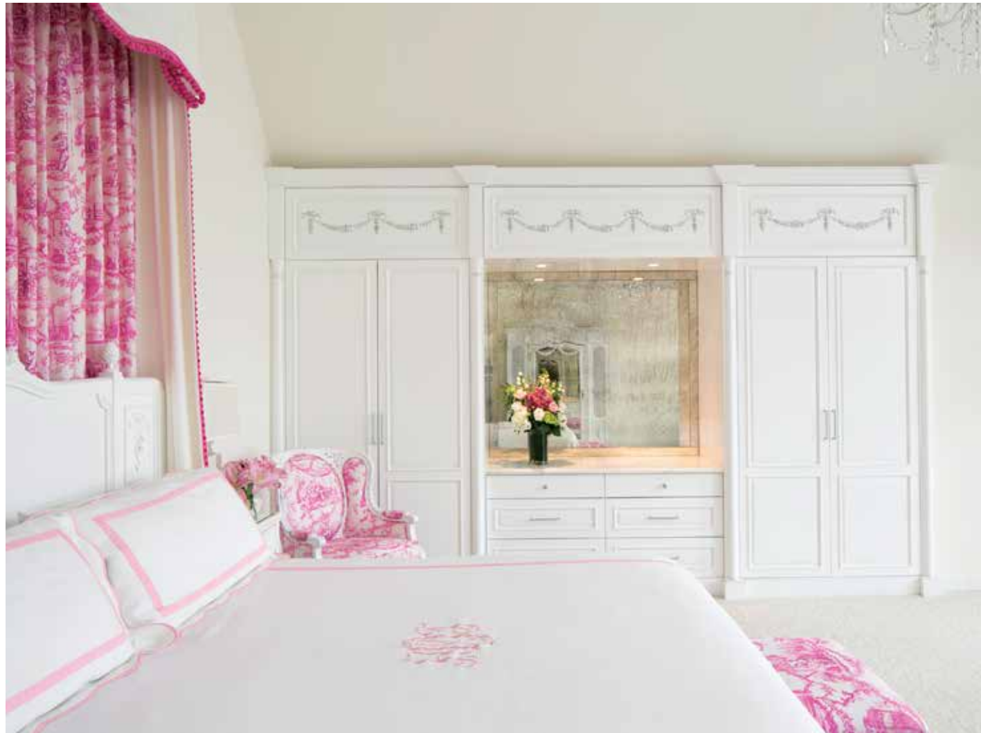
In the master bedroom (these pages), the owners' previous bedroom set was repainted white and given a dramatic pop of color with a Lee Jofa toile canopy in raspberry. Premier Custom Built provided new casework to expand the closet, inset with an antiqued mirror.

room and closet, it has been completely refitted and is now separated into a front kitchen—featuring a seating area and a bespoke, pagoda-style range hood over a white-enamel range—and a more private rear kitchen and pantry, where the mechanics of the kitchen are concealed behind walls of custom cabinetry.