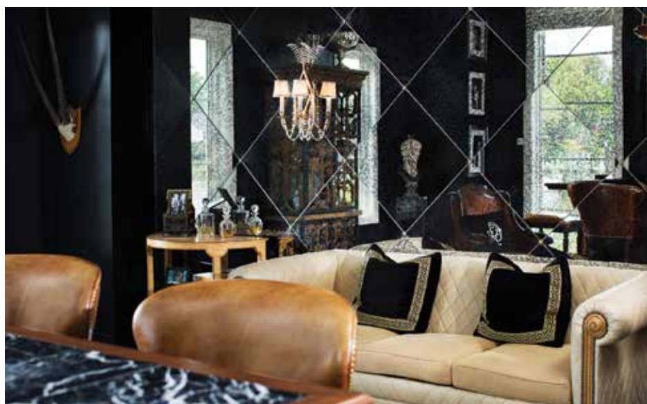
An animal-print stair runner adds a touch of glam to the foyer (top). The club lounge (above and opposite) is decidedly masculine, with walls painted in Benjamin Moore’s Onyx, a Stark rug and an oversized pony-leather ottoman. A custom bar overlooks Spa Creek; an antiqued-mirror wall opposite reflects water views back into the room.