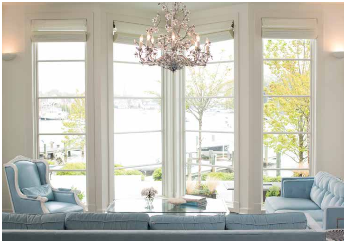
The dining room (right) pairs silver-finished chairs around a McLain Wiesand table. Sofas upholstered in soft-blue Kravet velvet pop in the dramatic, all-white living room (above and opposite), where a Niermann Weeks chandelier and an acrylic coffee table impart sparkle and reflectivity.